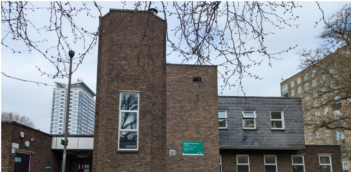
Wilditch Community Centre

Wilditch Estate Community Centre- 48 Culvert Rd, London SW11 5BB. events@enablelc.org