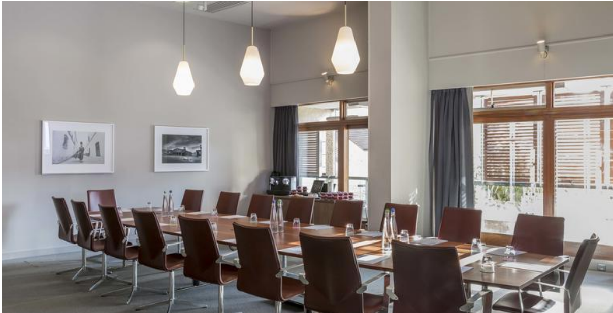
Photo courtesy of Barbican Centre – Frobisher Boardroom (barbican.org.uk)

The Barbican- Silk St, Barbican, London EC2Y 8DS. 020 7870 2500. business.events@barbican.org.uk.