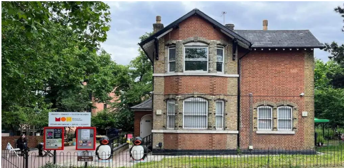
Photo courtesy of Living London History – “A Visit to the Museum of Homelessness” ( livinglondonhistory.com )

The Museum of Homelessness is a social history museum created with and by people with lived experience of homelessness. It preserves personal stories, runs exhibitions, community activities, and campaigns to challenge stereotypes and influence policy around homelessness.