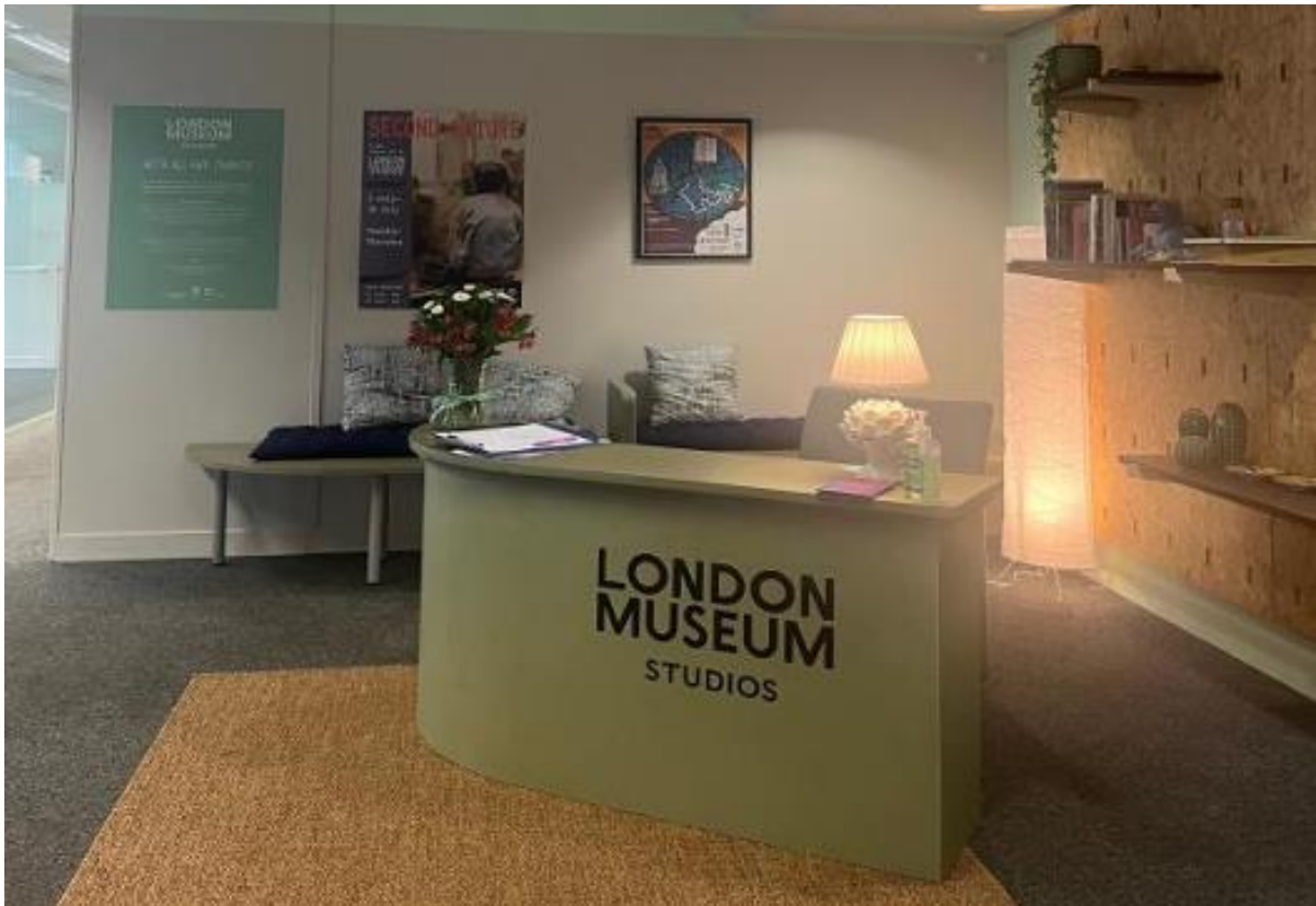
Photo courtesy of London Museum studios – Visual-Story-London-Museum-Studios.pdf

London Museum Studios- First Floor, Studio Smithfield, 1 East Poultry Avenue, EC1A 9PT. londonmuseumstudios@londonmuseum.org.uk