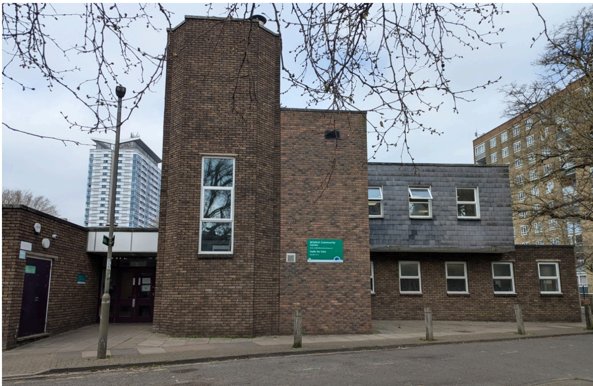
Photo courtesy of AccessAble – Wilditch Community Centre ( accessible.co.uk )

Wilditch Estate Community Centre - 48 Culvert Rd, London SW11 5BB. events@enablelc.org