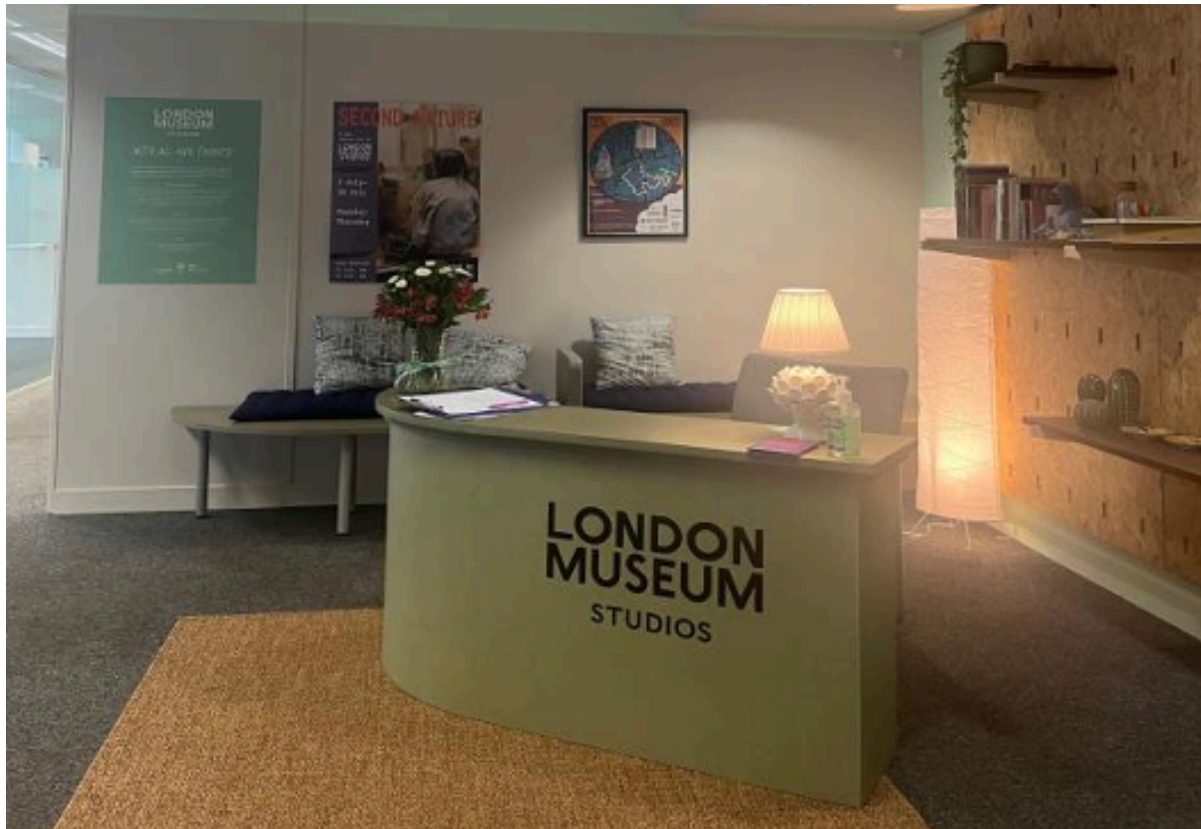
Photo courtesy of London Museum studios – Visual-Story-London-Museum-Studios.pdf

London Museum Studios- First Floor, Studio Smithfield, 1 East Poultry Avenue, EC1A 9PT. londonmuseumstudios@londonmuseum.org.uk