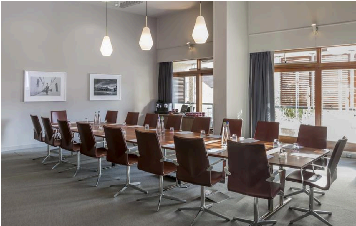
Photo courtesy of Barbican Centre – Frobisher Boardroom (barbican.org.uk)

The Barbican- Silk St, Barbican, London EC2Y 8DS. 020 7870 2500. business.events@barbican.org.uk.