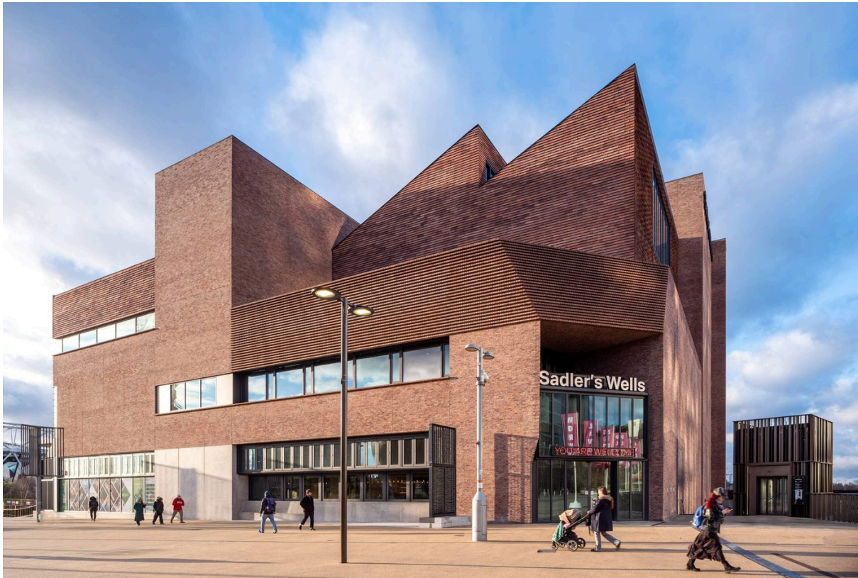
Photo courtesy of Architecture Today – Sadler's Wells East (Peter Cook)

Sadlers Wells East - 101 Carpenters Rd, Stratford Cross, London E20 2AR. 020 7863 8198. events@sadlerswells.com