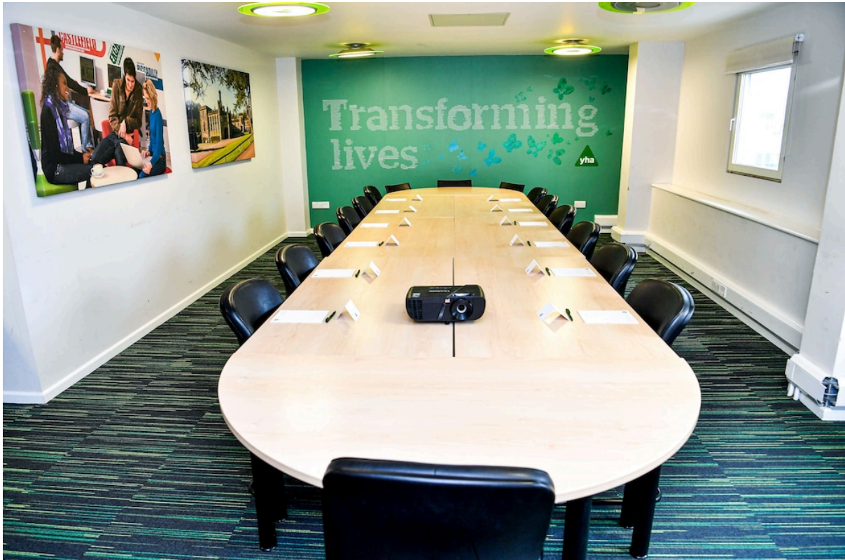
Kabannas St Pancras hotel

Kabannas London St Pancras (previously YHA)- 79-81 Euston Rd., London NW1 2QE. 020 7388 9998